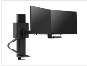
with Slim Profile Clamp TDD-MA-FS-251 (Snow White) TDD-MA-FS-224 (Matte Black)