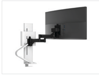
with Slim Profile Clamp TDS-MA-FS-251 (Snow White) TDS-MA-FS-224 (Matte Black)