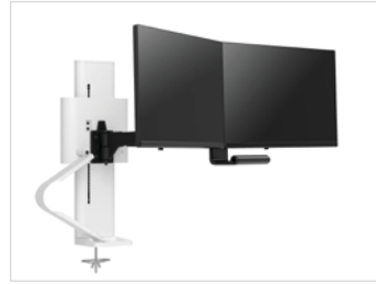
with Grommet Clamp TDD-MA-GR-251 (Snow White) TDD-MA-GR-224 (Matte Black)