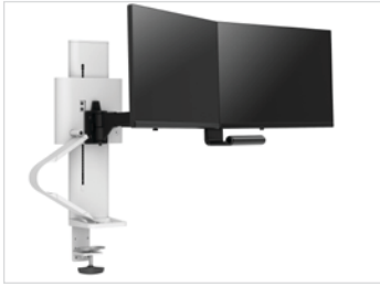
with Panel Clamp TDD-MA-PA-251 (Snow White) TDD-MA-PA-224 (Matte Black)