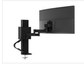
with Grommet Clamp TDS-MA-GR-251 (Snow White) TDS-MA-GR-224 (Matte Black)