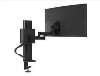
with Panel Clamp TDS-MA-PA-251 (Snow White) TDS-MA-PA-224 (Matte Black)