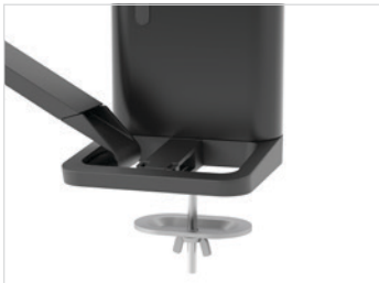
Grommet 98-492-009 (Matte Black)

Contact us to discover the full statement of line.