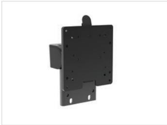
47-109-224 (Matte Black)