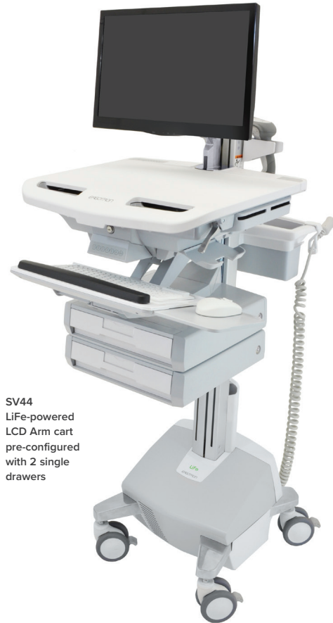
SV44 LiFe-powered LCD Arm cart pre-configured with 2 single drawers

SLA OR LiFe BATTERY POWERED DOCUMENTATION CART WITH OPTIONAL DRAWERS