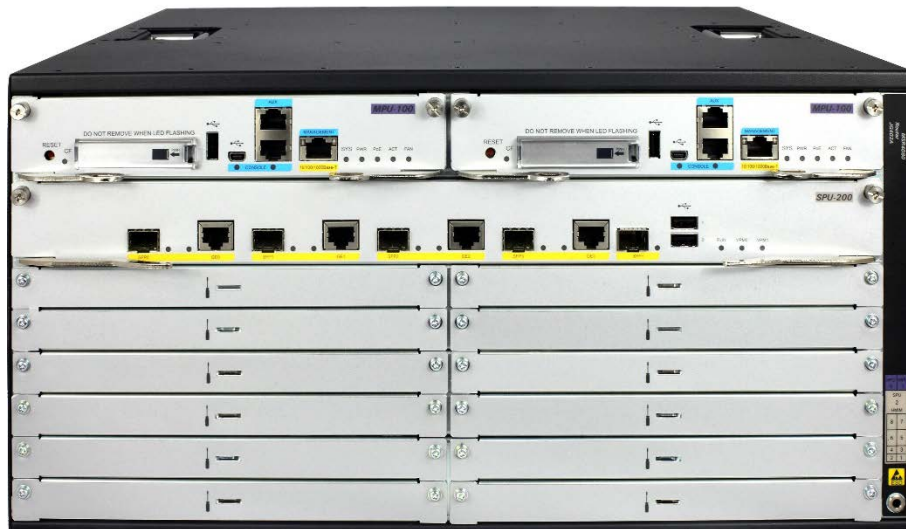
HPE FlexNetwork MSR4080 Router Chassis (SPU-200) - Front View

The MSR4000 series provides an agile, flexible network infrastructure that enables you to quickly adapt to your changing business requirements while delivering integrated concurrent services on a single, easy-to-manage platform.