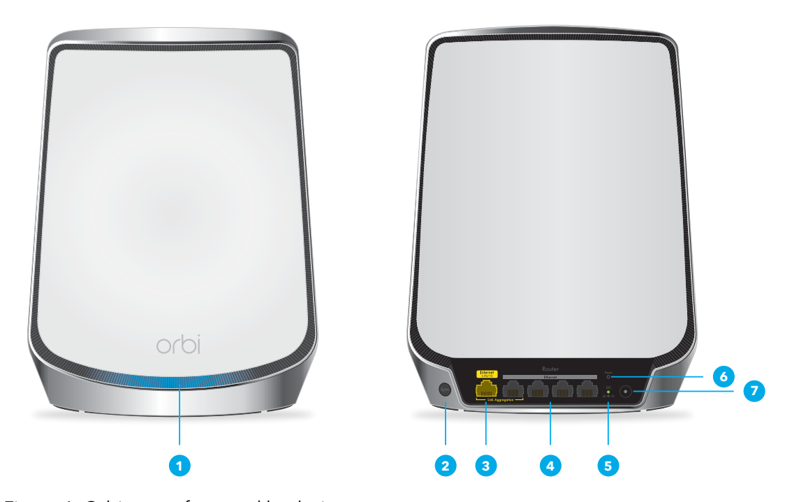
Figure 1. Orbi router front and back views

The following figures shows the Orbi router hardware features.