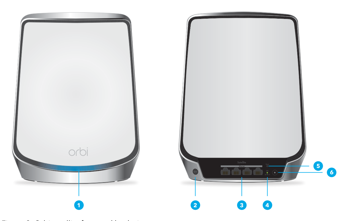
Figure 2. Orbi satellite front and back views

The following figures shows the Orbi satellite hardware features.