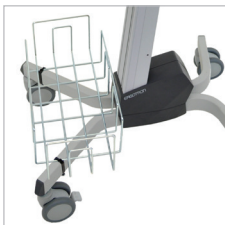
NF CART WIRE BASKET KIT 97-544