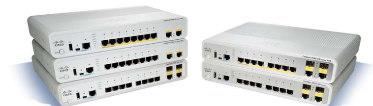
Figure 1. Cisco Catalyst 3560-C and 2960-C Series Compact Switches